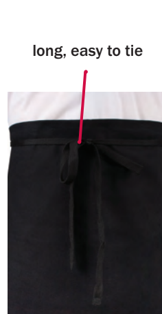
long, easy to tie