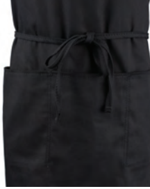
Several easy-to-reach spacious pockets to hold check books and pens