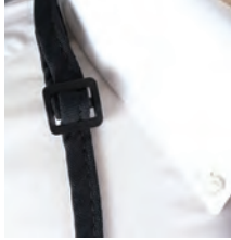
Adjustable neck for a custom fit