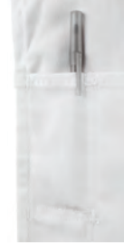
Double-stitched between pockets with seamless bottoms