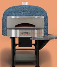
the ELECTRIC (Neapolitan Design)