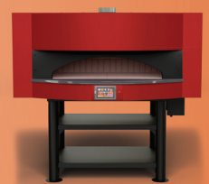
MS SERIES (Space Efficiency)