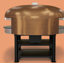
PASS-THRU (Due Bocche Oven)