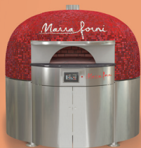
the ROTATOR (High Production)