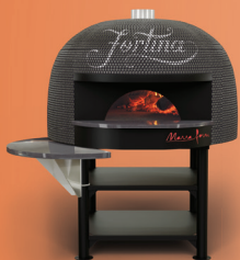
the NEAPOLITAN (Wood-Fired Cooking)

Marra Forni has many test kitchens located throughout North America, Canada, the Middle East, and Latin America. You can take your next authentic Italian wood, gas, or electric brick oven for a test drive anytime.